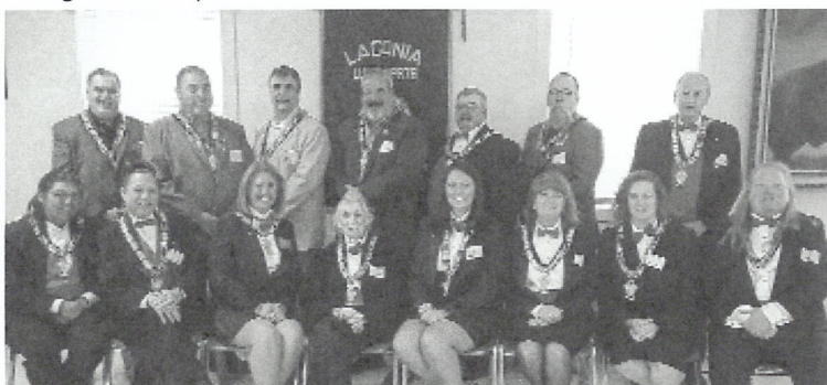
Our lodge gained five new members at the end of February. Let's make them feel welcome and involve them in our work and activities.