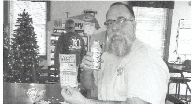
This is what a $1000 winner looks like! - Congratulations!!

Many of our members have a lot of fun playing the games at the lodge. Some definitely are "close friends" with Lady Luck.